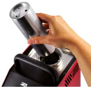
Dry block calibration