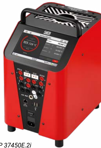
TP 37450E.2i Integrated measuring instrument