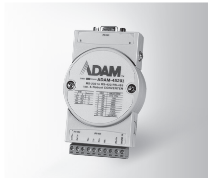
ADAM-4520I FCC CE RoHS UL US