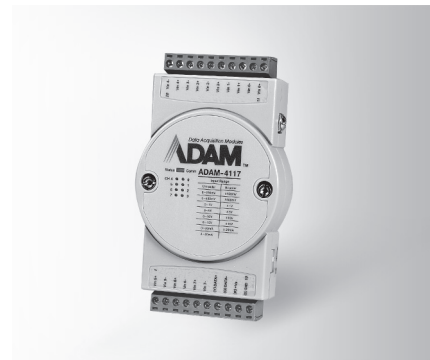
ADAM-4117 FCC CE RoHS UL US