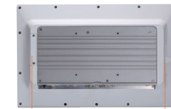
Smart card reader cover ▲ Rear view CFast™ cover