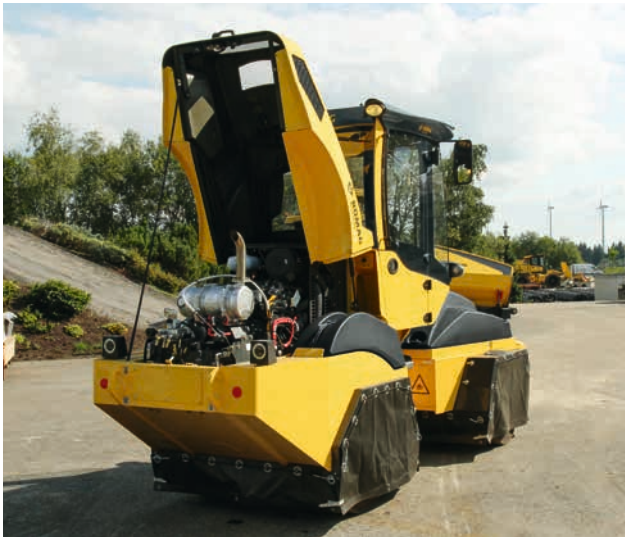
The hinged engine hood can be opened wide allowing fast, unobstructed access to the engine.

A powerful working machine has to be able to do one thing above all: roll, roll and roll again. Downtime therefore has to be kept to an absolute minimum. With such easy maintenance, the BW 11 RH-5 meets this requirement perfectly.