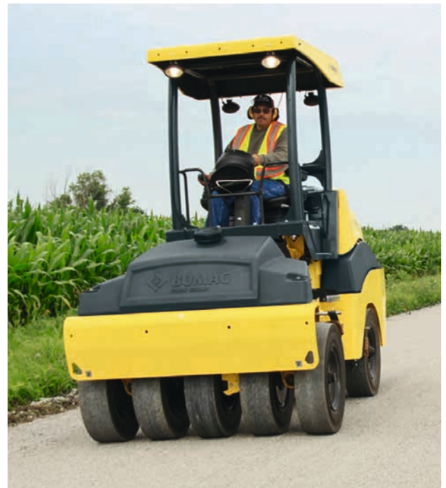
The BW 11 RH-5 gives perfect compaction and a smooth and even surface finish.

For chip sealing, an asphalt binder is sprayed onto the road and covered with a single -size aggregate chip layer. The roller takes care of the sealing. The new surface is then rolled to bed the aggregate chippings. Excess chips are removed after a curing period of 24 hours.