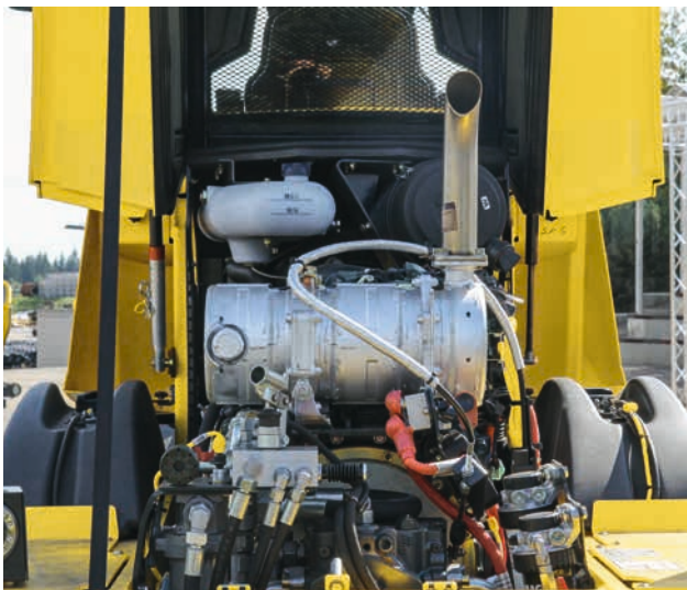
All engine service points are easy to access. So maintenance work can be performed quickly and easily.

The radiator is in an excellent vertical position right behind the cab. This means it stays clean and doesn't need extra cleaning. Maintenance-free SAHR brakes also increase the ease of service on this model.