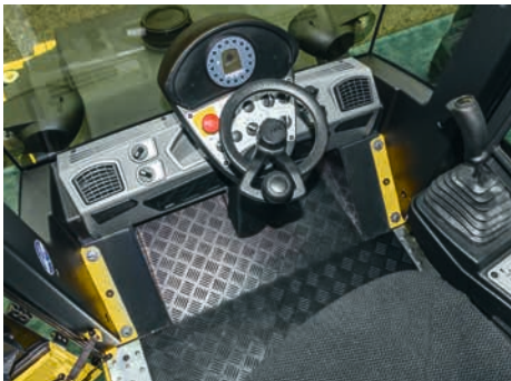
The room in the highly spacious cab is in a class of its own. For ideal work conditions.

Roller operation is intuitive and fast. The self-explanatory functions make the roller easy to handle. The driver has all indicators and operating controls in reach and in sight. That means faster operations and even better ease of operation.