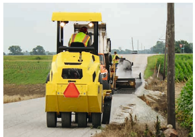
Top speed is 20 km/h. This offers great surface coverage.