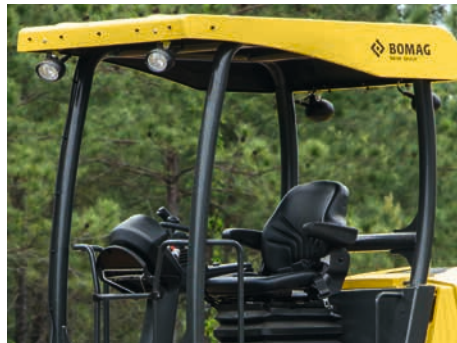
If no heating or air conditioning is required, the BW 11 RH-5 can also be delivered with ROPS/FOPS.