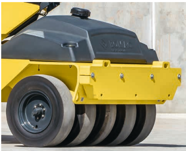
To increase stability the ballast compartments have been positioned extremely low down, as shown here above the front axle.

Precisely balanced weight distribution directly affects a range of roller characteristics. Handling, acceleration, traction and service life of components also affects them too. This results in perfect driving characteristics. And superior surface quality and compaction.