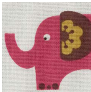
▶ Before applying with the Texture Smoothing function

This software is specifically designed for digital textiles and printings, offering many image improving functions, such as Texture Smoothing, Luminosity Sharpen and Detail Enhancement. ScanWizard DTG is good for using on printing digital patterns in textile, printing, dyeing and ready-to-wear industries.