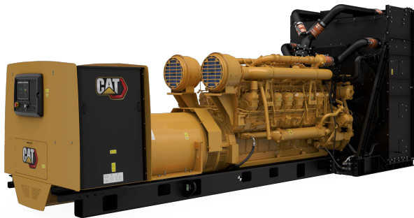
Image shown may not reflect actual configuration