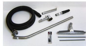
Ø2" (Ø50 mm) Static Dissipative Tools and Accessories - Included