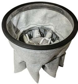
New Star Shaped filter with Manual Filter Shaker