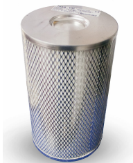
HEPA Filter - Downstream - Optional