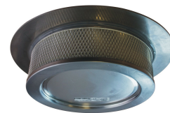
HEPA Filter - Upstream - Optional