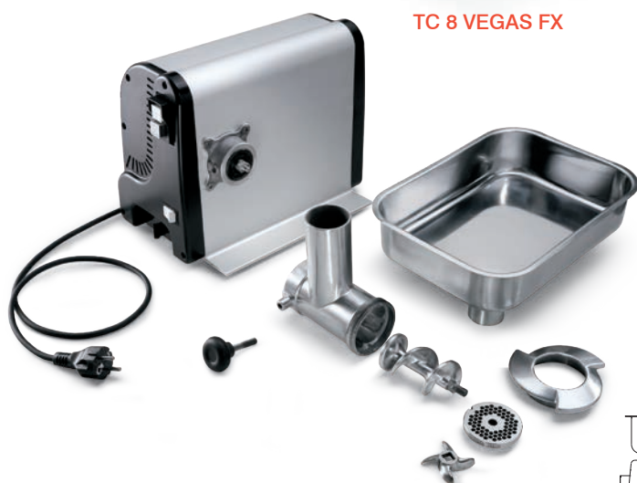
TC 8 VEGAS FX