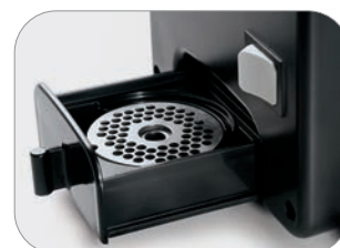
Cassetto porta coltello e piastra Compartment for knife and blade