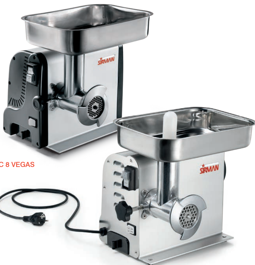
TC 8 VEGAS