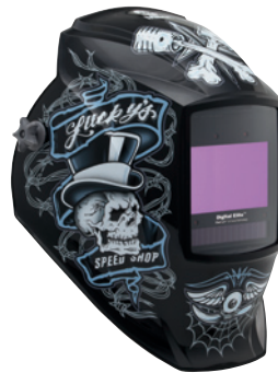
Lucky's Speed Shop™ 289756