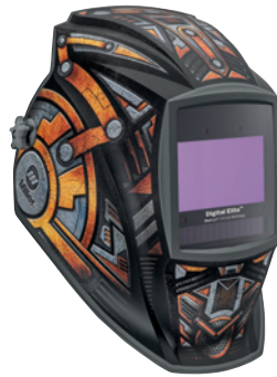
Gear Box™ 289844