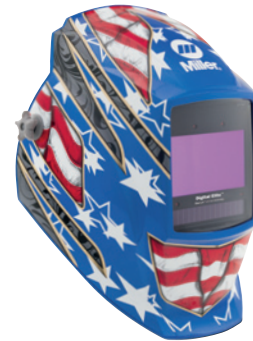
Stars and Stripes™ III 289759