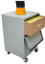
TV-560 (WF) Cassette Filter - Included