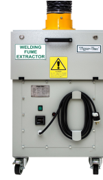
TV-560 (WF) Filter Blockage Indicator Light and Hour Counter - Included