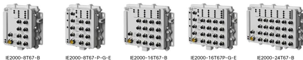
Table 2. Industrial Ethernet 2000 IP67 Series configuration