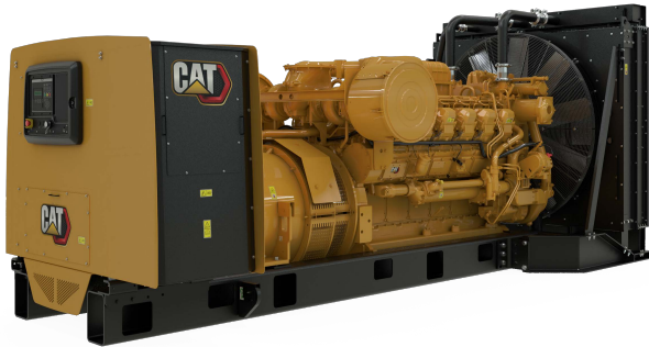
Image shown may not reflect actual configuration