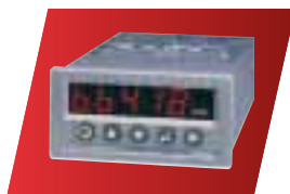
DML330 page 6

5 digit indicator Dual alarm relays Analogue output Serial output Logic status Universal input