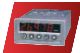
DML340 page 6

5 digit indicator Dual alarm relays LVDT input