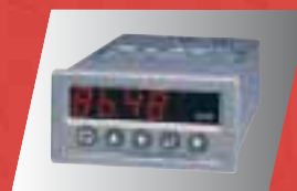
DMP210 page 4

Model DML220 and DML340 are available from stock