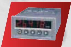
DMP230 page 4

Surface mount and microprocessor technology has enabled powerful features to be packed into a 1/8 DIN case. No maintenance is necessary.