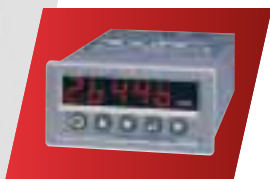
DMP240 page 4

5 digit indicator Analogue output Serial output Logic status Universal input