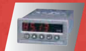
DMP220 page 4

4 digit indicator Dual alarm relays Universal input