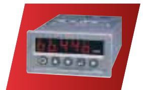
DML350 page 6

5 digit indicator Dual alarm relays LVDT input